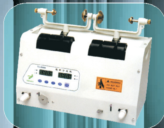
mod. TJ-20SD cod. 260 (bobinatore elettronico)