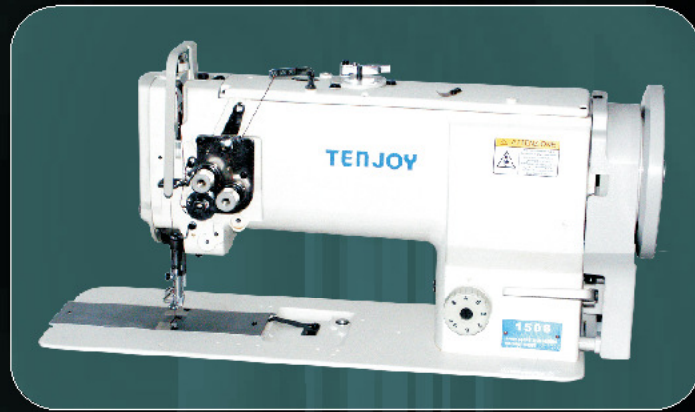
mod. TJ1508 cod. 487 (Testa piana triplice)