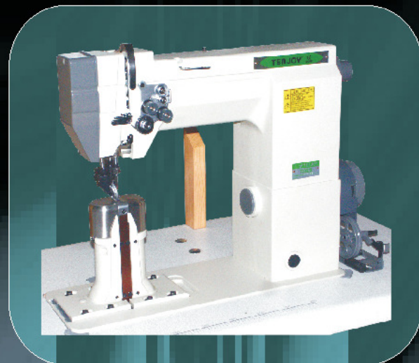
mod. TJ9020 cod. 550 (Testa colonna 2 aghi)