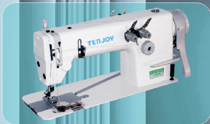
mod. TJ3800 cod. 510 (Testa 2 aghi punto catenella)