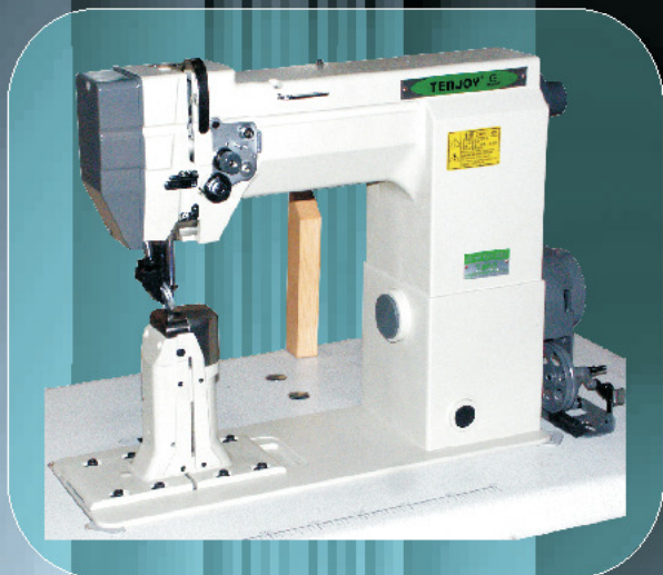
mod. TJ9010 cod. 540 (Testa colonna 1 ago)