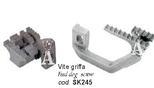
Vite griffa Feed dog screw cod. SK245