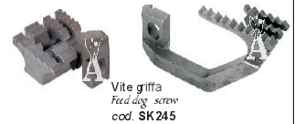
Vite griffa Feed dog screw cod. SK245