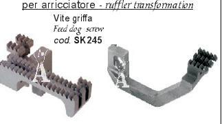
Vite griffa Feed dog screw cod. SK245