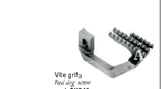
Vite griffa Feed dog screw cod. SK245