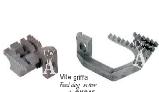
Vite griffa Feed dog screw cod. SK245