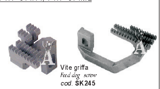
Vite griffa Feed dog screw cod. SK245