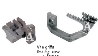
Vite griffa Feed dog screw cod. SK245