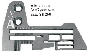
Vite placca Needle plate screw cod. SK260

KI. 516M1-55, 516H1-55, 872A-083-5, 872A-065-5, 429-00-2MD-10