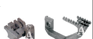
Vite griffa Feed dog screw cod. SK245