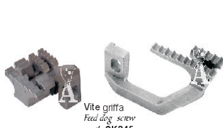
Vite griffa Feed dog screw cod. SK245