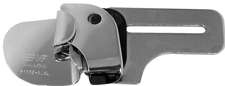
LAP SEAM FOLDER

Per macchine piane a 2 o 3 aghi For 2 or 3 needle flat bed machines