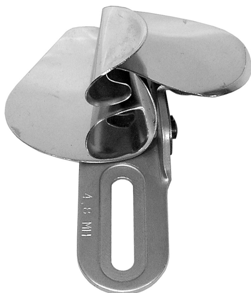
LAP SEAM FOLDER

Per "SINGER" 112W, 212W, ecc. For "SINGER" 112W, 212W, ecc.