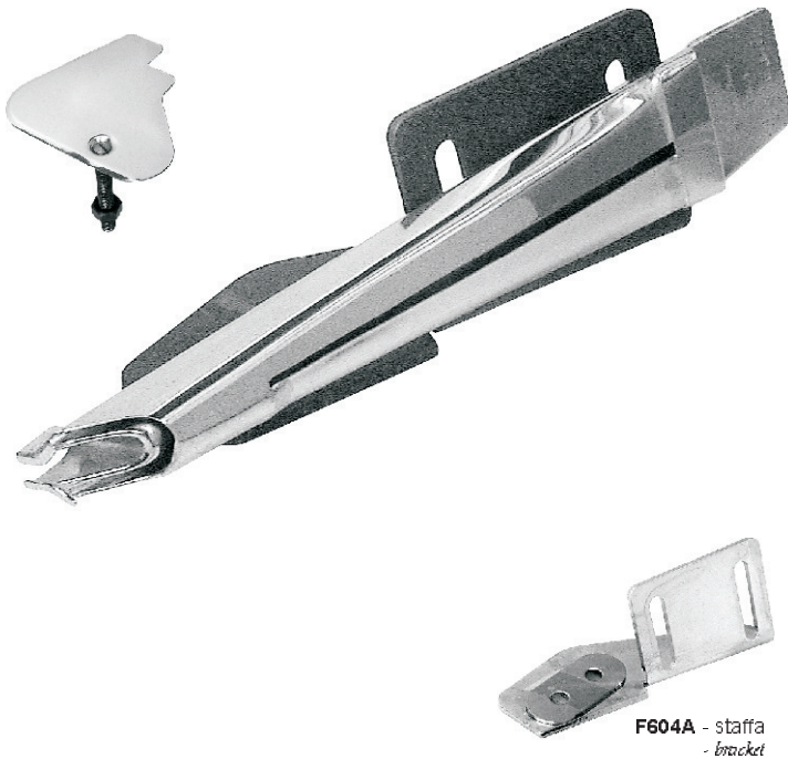
F604A - staffa - bracket

Per macchine piane For flat bed machines