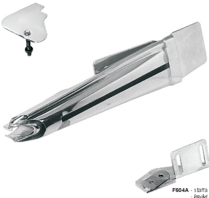
F604A - staffa - bracket

Per macchine piane For flat bed machines