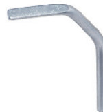
Guida barra Needle bar guide cod. 18-7250-0