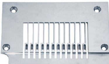
Placca Needle plate cod. 14-5000-0 (3/16") cod. 14-4990-0 (1/4")