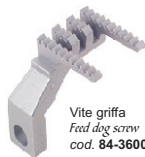
Vite griffa Feed dog screw cod. 84-3600-0