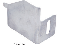
Staffa Holder base cod. 26-7810-0