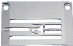
Vite placca Needle plate screw cod. 87-1660-0

Needle plates and feed dogs for covering operations (C)