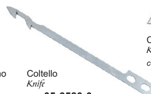
Coltello Knife cod. 05-6580-0