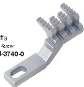
Vite griffa Feed dog screw cod. 84-3740-0

Kl. RX9702A, RX9802A, RX9703A, RX9803A, RX9702D, RX9802D, RX9703D, RX9803D