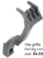
Vite griffa Feed dog screw cod. 84-3590-0

Kl. WX8702D, WX8802D, WX8703D, WX8803D, WX8703DE, WX8803DE