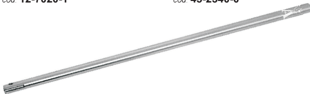
Passafilo (D) Thread guide (D) cod. 45-2340-0