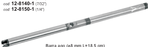
Barra ago (ø8 mm L=18,5 cm) Needle bar (ø8 mm L=18,5 cm) cod. 11-8010-0