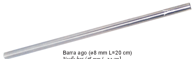
Barra ago (ø8 mm L=20 cm) Needle bar (ø8 mm L=20 cm) cod. 11-1520-0